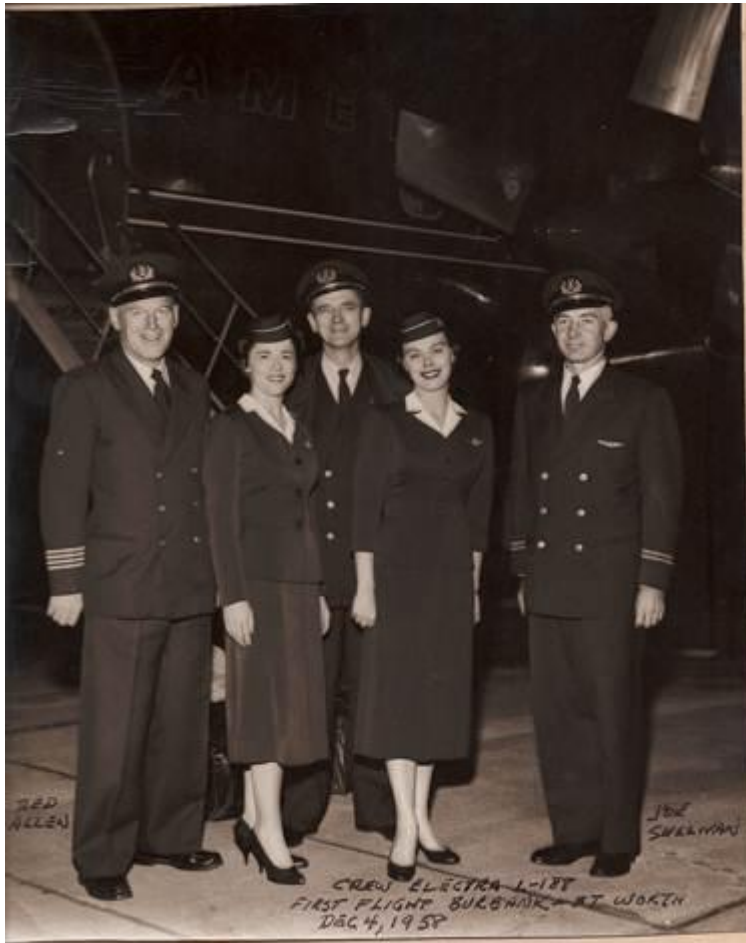
Electra L-188 Crew – First Flight BUR – FTW December 4, 1958